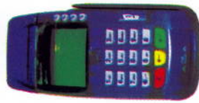
VERIFONE OMNI 3750