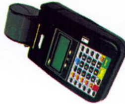
HYPERCOM T7 PLUS